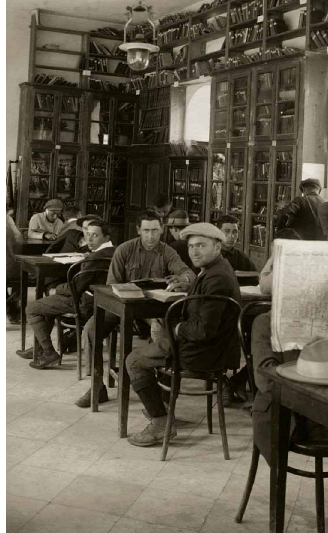
Reading room in Bayit Ne'eman, the first permanent home of The National Library in the beginning of the 20th century

The document begins by presenting The Concept of Library Renewal , including the vision of the new Library. The Library's Objectives for 2010–2016 are then defined and explained, including a list of near-term and multi-year goals.