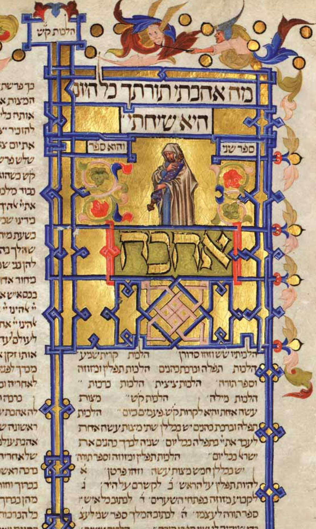
Mishneh Torah, Maimonides, Spain, 14th century